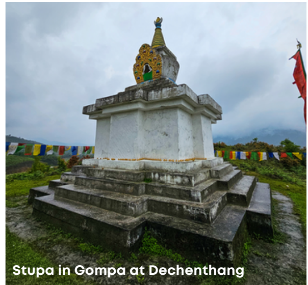
Stupa in Gompa at Dechenthang