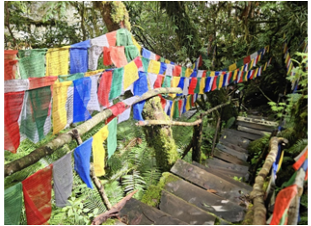
Wooden Stairs on the way to Lucky stone