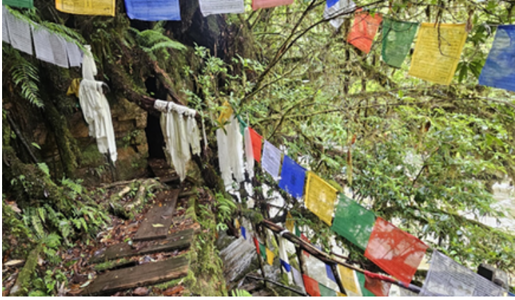
Way to holy cave